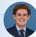
JD Ogden Analyst

These materials and any presentation of which they form a part are neither an offer to sell, nor a solicitation of an offer to purchase an interest in any security sponsored by Dynamic Core Capital. This presentation is for discussion purposes only. Past performance does not guarantee future results.