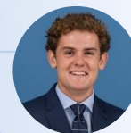
JD Ogden Analyst

These materials and any presentation of which they form a part are neither an offer to sell, nor a solicitation of an offer to purchase an interest in any security sponsored by Dynamic Core Capital. This presentation is for discussion purposes only. Past performance does not guarantee future results.